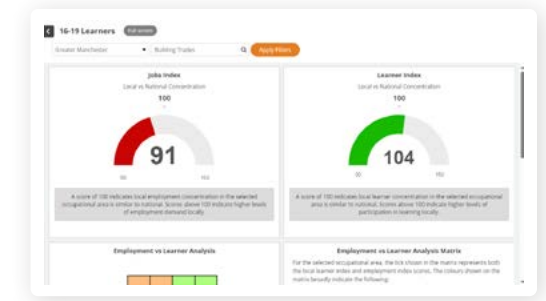
New Supply vs Demand Analysis Gauges