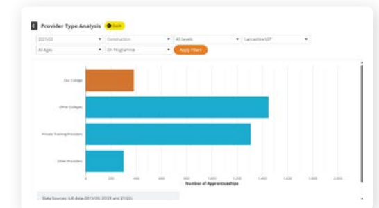
Example Vector Chart